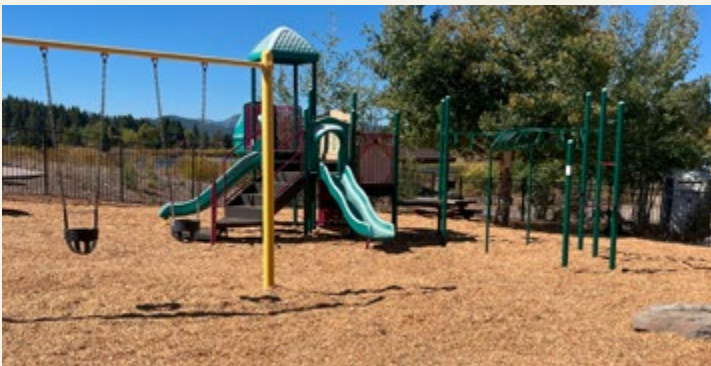
New Playground Safety Surface mulch. Replaced in September 2024.