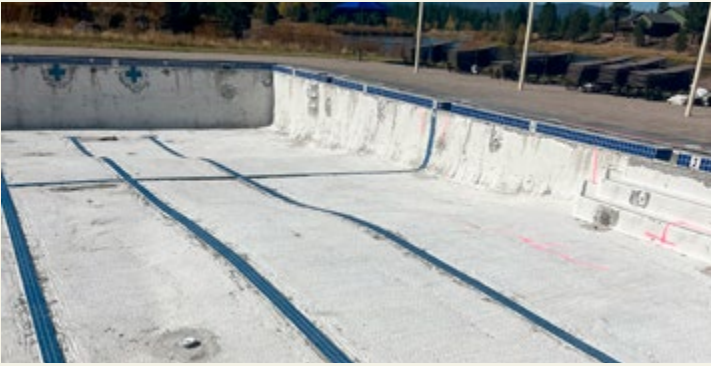
The pool was drained, resurfaced, repaired, repainted, and refilled.