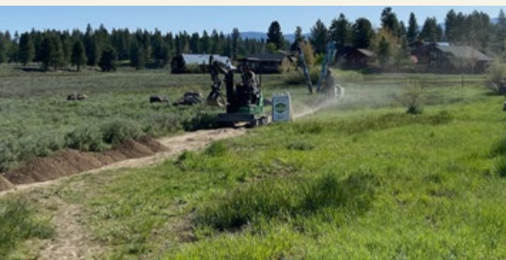
The decomposed granite trails around the Glenshire Pond were improved. Improved in May 2024.