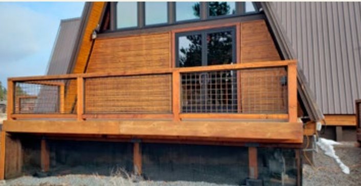
New deck material, added ember mesh under the deck for home hardening. Replaced in Spring 2024.