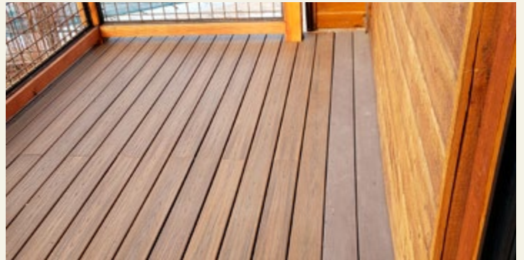
New deck material, added fire retardant deck boards next to building. Replaced in Spring 2024.