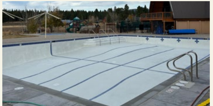
The pool was repaired in October 2024.