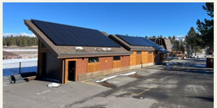
The solar panel project was finished on the pool maintenance building in August 2024.