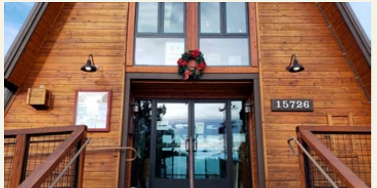
New windows and doors. Replaced in September 2024.